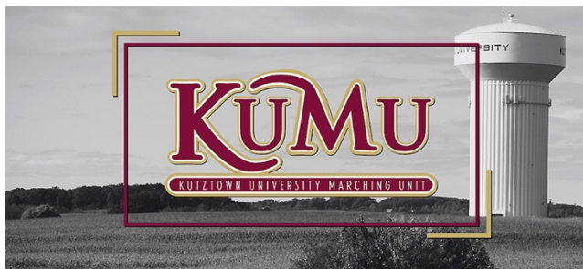
Membership Interest Video #2: KU Marching Unit