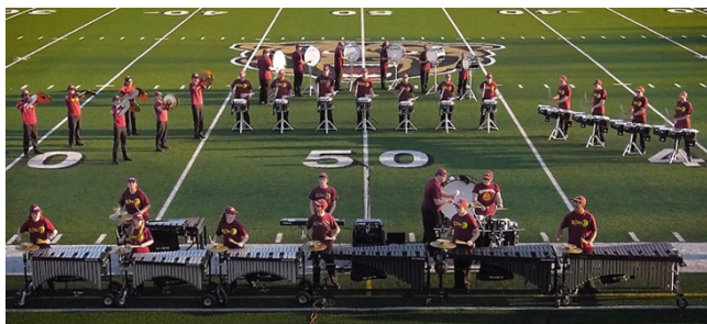
Membership Interest Video #1: KUMU Percussion

We invite you to watch two of our Membership Interest videos. The upperclassmen of KUMU share some of their positive experiences of being in the band and percussion section.