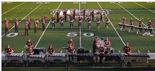
Membership Interest Video #1: KUMU Percussion

We invite you to watch two of our Membership Interest videos. The upperclassmen of KUMU share some of their positive experiences of being in the band and percussion section.