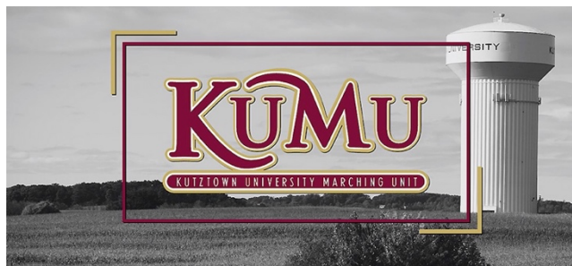
Membership Interest Video #2: KU Marching Unit